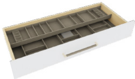
JEWELRY & ACCESSORY ORGANIZER W/ TOP TRAY