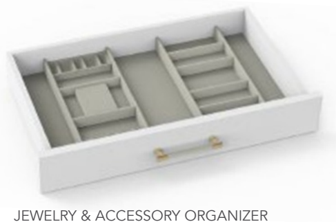
JEWELRY & ACCESSORY ORGANIZER